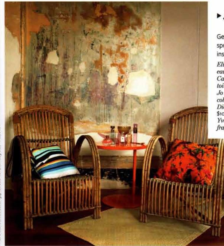
Aero table and butterfly plus cushion, at Ruby Star Trailers.