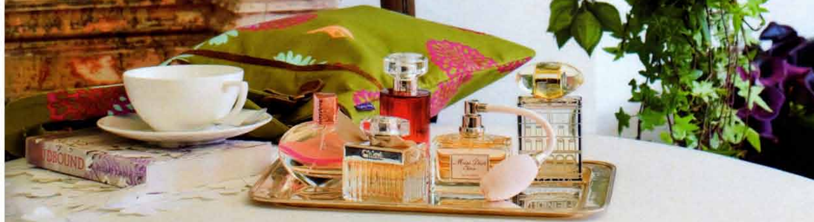
Cote Bastide tray at Studio imports. Only Midge handbag, Geïosa ottoman, Jasper Conran teacup and saucer at Wedgewood.

The votes are in! The judges at In Style's inaugural Fragrance Awards 2008 sniffed out the standout scents of the past year. The result? A lush collection of fragrances you're sure to love —Naomi Jackson