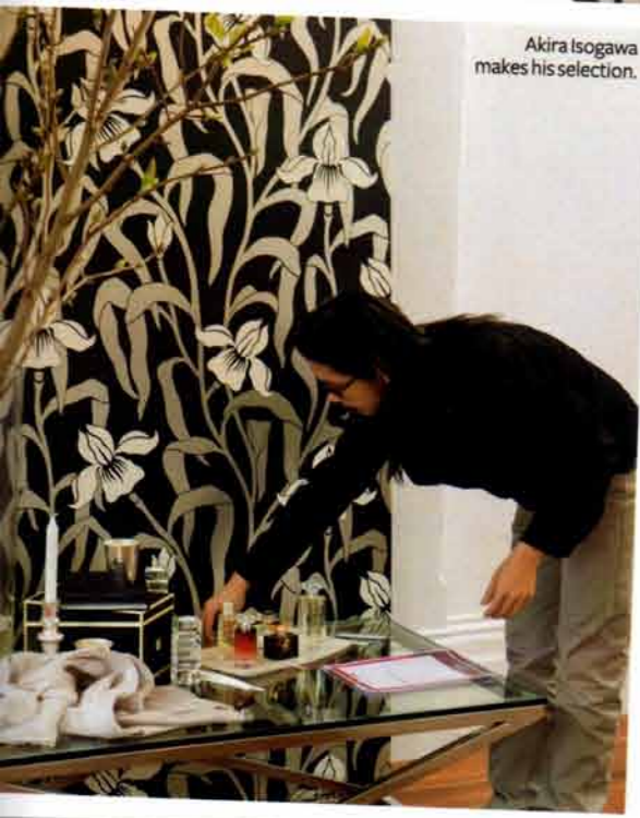
Osborne & Little Vintage Iris wallpaper at Mokum. Table and candlesticks at Coco Republic. Platter at Mud Australia.