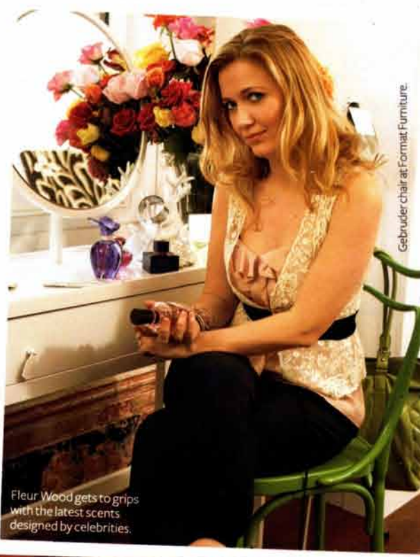
Gebrüder chair at Format Furniture.