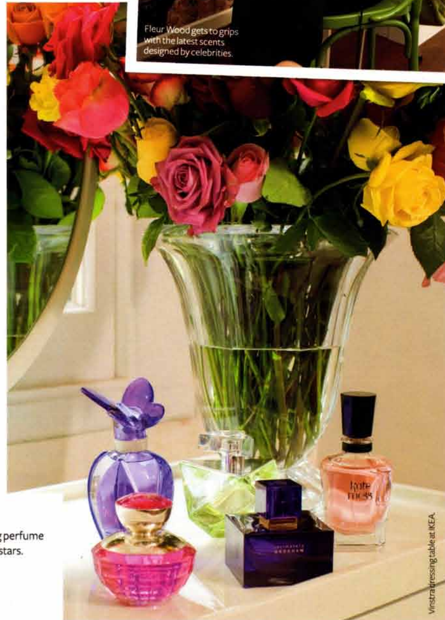
Vinstratressing table at IKEA.